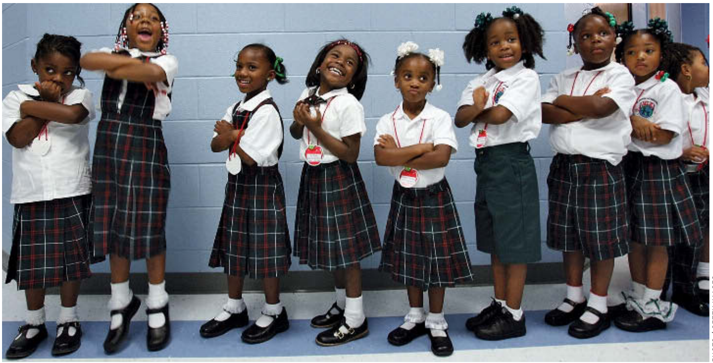
In the fall of 2008, 870 students in kindergarten through 3rd grade from low-income families received vouchers to attend the private schools of their choice.

Opponents took on an air of resignation. The New Orleans Times-Picayune , one of the most prominent papers in the state, had run an editorial condemning the bill in May. By June, editors could read the writing on the wall and in their pages argued for “strengthening” the bill (i.e., amending the accountability provisions) rather than defeating it.