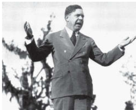
Louisiana is known for colorful politicians like longtime governor Huey Long.

School governance is no exception. Prior to Hurricane Katrina, the Orleans Parish School Board (OPSB) was the strongest board politically in the state. It oversaw the largest district, the most students, and the biggest budget. It employed more teachers and staff than any other district, a ready resource for phone calls and letters directed at state officials. Its boundaries overlapped with 15 seats in the Louisiana House of Representatives and another 7 in the Senate, representing about 15 percent of the legislature, far more than any other school district. New Orleans was also home to the state’s strongest teachers union, United Teachers of New Orleans (UTNO). In the 1970s, it was the first teachers union in the Deep South (and the