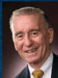
WALTER CUNNINGHAM APOLLO 7 ASTRONAUT