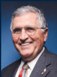
HARRISON SCHMITT, PH.D. APOLLO 17 ASTRONAUT