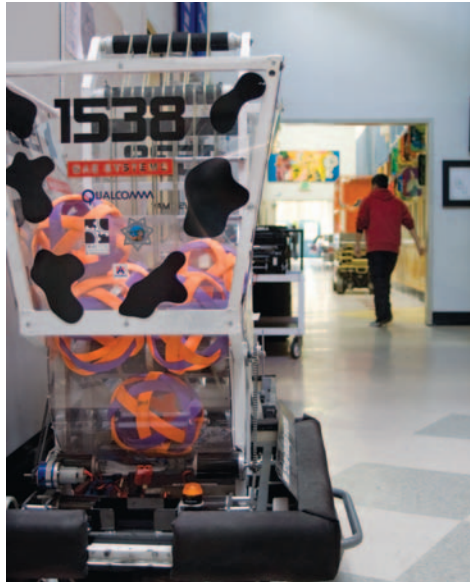
Hallways at High Tech High are lined by prize-winning robotics projects.

Elsewhere in the charter universe, schools are incorporating hybrid and blended structures into already successful school organizations, which increasingly seek efficiency, even as they expand and work to maintain excellent student achievement. The impact has been dramatic, for example, at Carpe Diem Collegiate High School of Yuma, Arizona. Carpe Diem represents what will likely be a crucial chapter in the story of blended schools: a turn to a blended model because of financial or facilities challenges. The charter school, which serves 250 mostly low-income students in