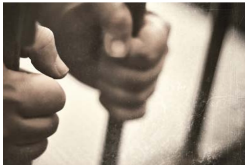
Detentions, suspensions, and expulsions are the potential first steps in the “school-to-prison pipeline.”

Although these results are based on a single state, they should encourage efforts to promote greater diversity in the teaching workforce, which remains overwhelmingly white. In addition to offering more diverse role models at the front of the class, our findings suggest that employing more teachers of color could help minimize the chances that students of color, who trail their white peers in academic