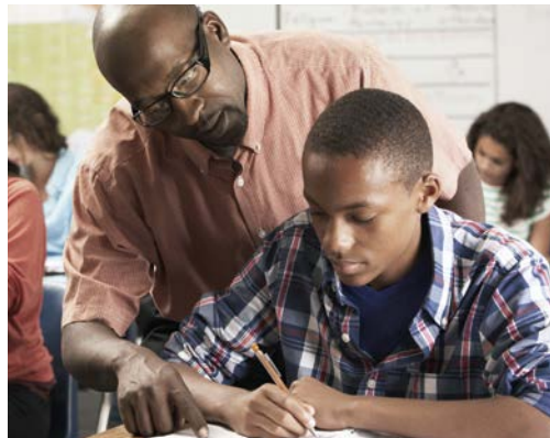
The overall effect of race matching on discipline outcomes is largest for black male students.

that a principal may consciously assign a child who had several disciplinary incidents in his 1st-grade year to a demographically similar teacher for 2nd grade, in hopes of finding a better fit for the child. This type of behavior could exaggerate the race-matching effects we find. However, we find no evidence that students' disciplinary outcomes are systematically related to whether they are assigned to a same-race teacher in future years. Additionally, we find a similar pattern of race-matching effects when we exclude students who received exclusionary discipline penalties in the prior year.