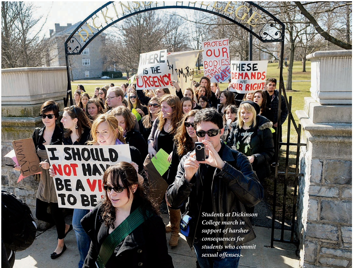
Students at Dickinson College march in support of harsher consequences for students who commit sexual offenses.

disparagement of a person based on a perceived lack of stereotypical masculinity or femininity.” To violate Title IX, harassment “does not have to include intent to harm, be directed at a specific target, or involve repeated incidents.”