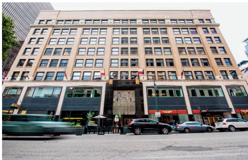
UATX is renting part of the historic Scarbrough Building in downtown Austin as its initial campus space. The 1908 art deco building once housed a department store.

Shires says that accreditors tend to do a lot of benchmarking. "They ask, 'What does your institution look like relative to everybody else?'" Accreditors may press UATX to make their college conform to the practices of similar schools: if a peer institution like Baylor University has X number of administrators in Office Y, then UATX might need to ensure it has the same number.