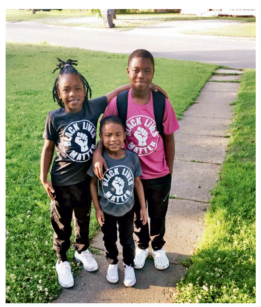
When three brothers from Ardmore, Oklahoma, wore Black Lives Matter shirts to school in 2021, two were disciplined for displaying "political statements."

How can proponents of robust civic education initiate the kind of widespread reform that I have sketched here?