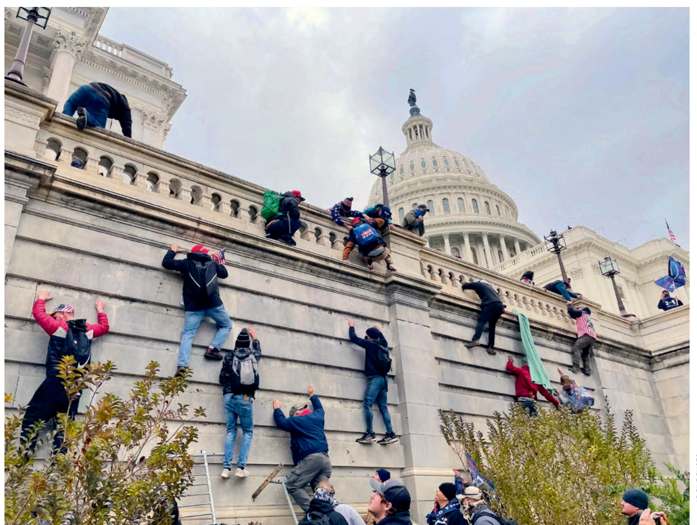
The storming of the U.S. Capitol on January 6, 2021, has been called "a sputnik moment for an ambitious revival of civics instruction."

These competing projects have been amply debated, and I have no interest in rehearsing those discussions here. I do, however, want to press two observations. First, the 1619 Project and the 1776 Report both portrayed themselves as tools of civic education. Each contemplated how schools could implement the animating ideas of the respective projects, and various educators across the nation have done